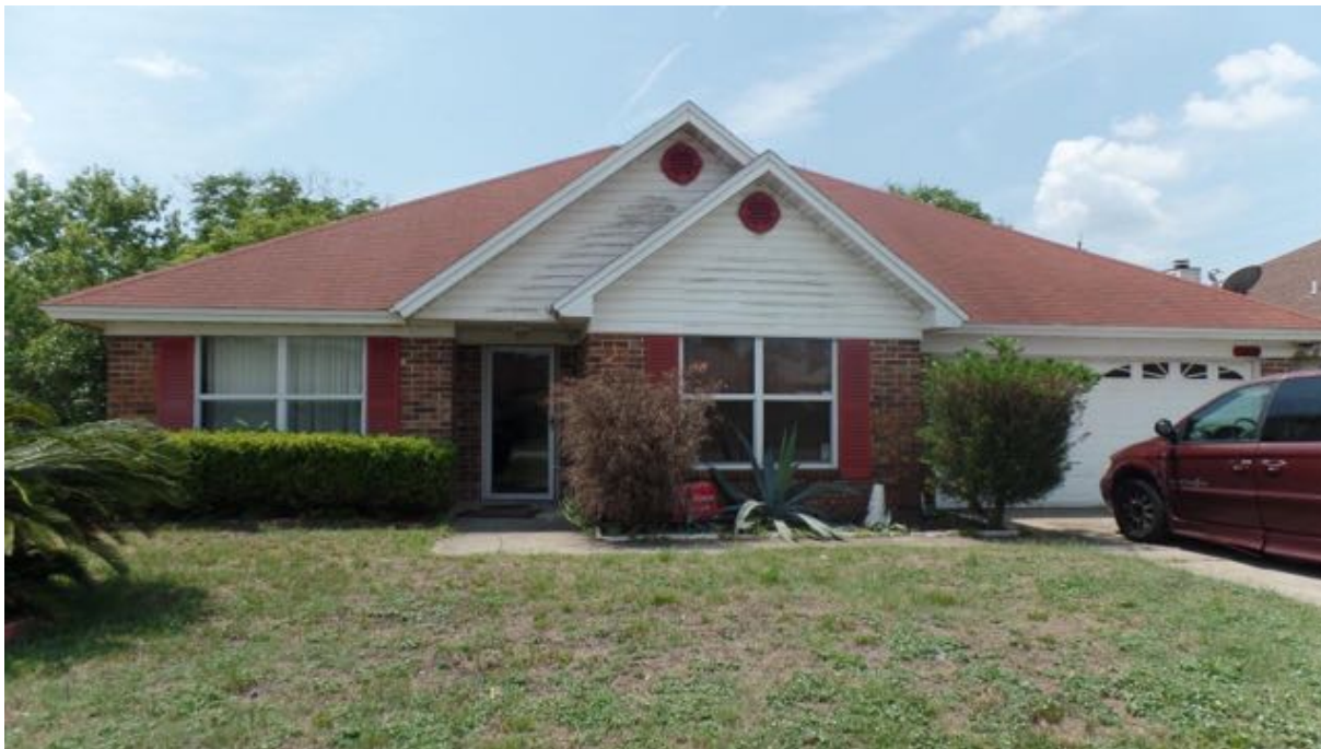
Kabroon Circle 11408 Kabroon Circle Jacksonville, FL 32246